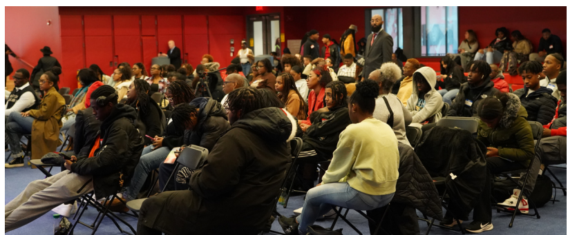
Teen members from Harlem, Brooklyn and the Bronx attended panels on music, social justice and more.

We are grateful to have the opportunity to provide our members with stimulating conversations and impactful events such as this. We want to say thank you to donors like you. Your commitment is crucial in our ability to continue shaping and supporting the futures of talented young minds.